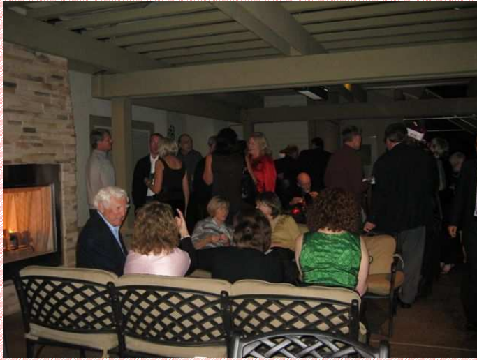
Members enjoying the patio

Members, Staff and Guests gathered together at RCI's end of the year, holiday cocktail party on Dec. 11, 2010. It was a great way to end a wonderful year!