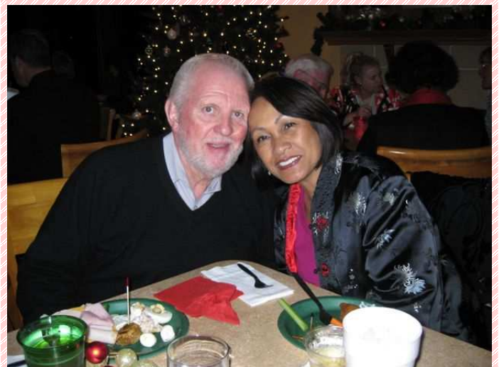
The Browns enjoy the Holidays